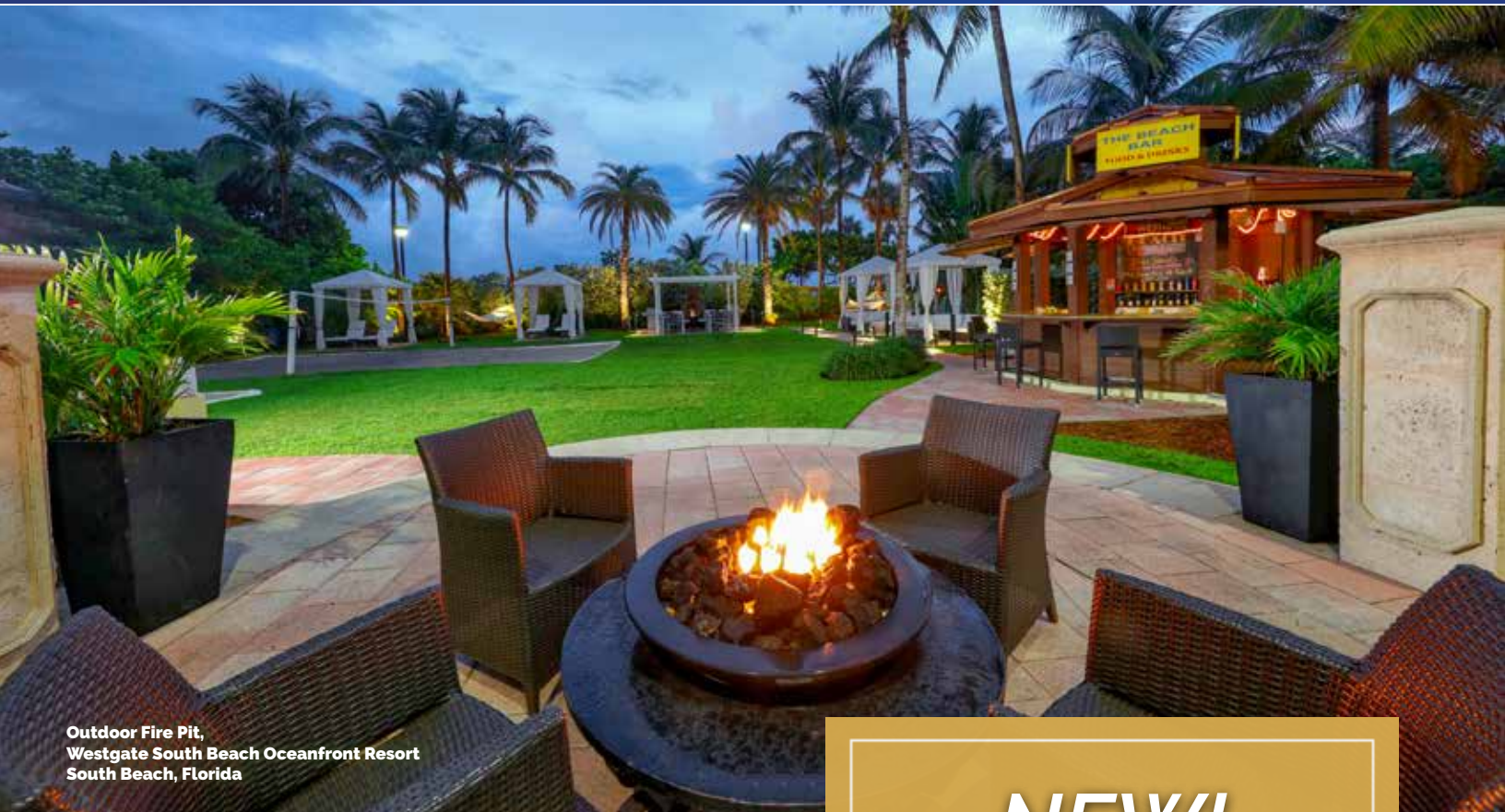
Outdoor Fire Pit, Westgate South Beach Oceanfront Resort South Beach, Florida