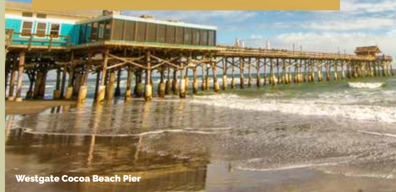
Westgate Cocoa Beach Pier

Priority will be given to home resort owners who reserve a stay at their respective home resort using a banked week.