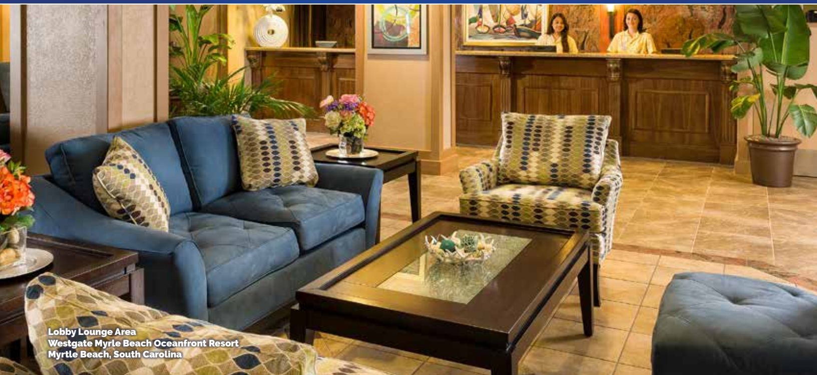
Lobby Lounge Area Westgate Myrtle Beach Oceanfront Resort Myrtle Beach, South Carolina