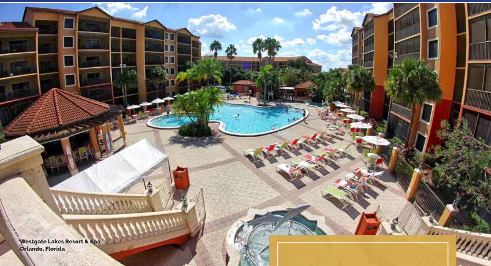
Westgate Lakes Resort & Spa Orlando, Florida

Pre-planning is important and it allows Westgate Resorts to allocate inventory in advance, making it more convenient for owners to use their weeks. To avoid paying a higher fee to reinstate your expired week, you must call before the end of your occupancy year to inform Westgate Resorts of your intent to bank your week. If your week is not banked, it will be considered expired.