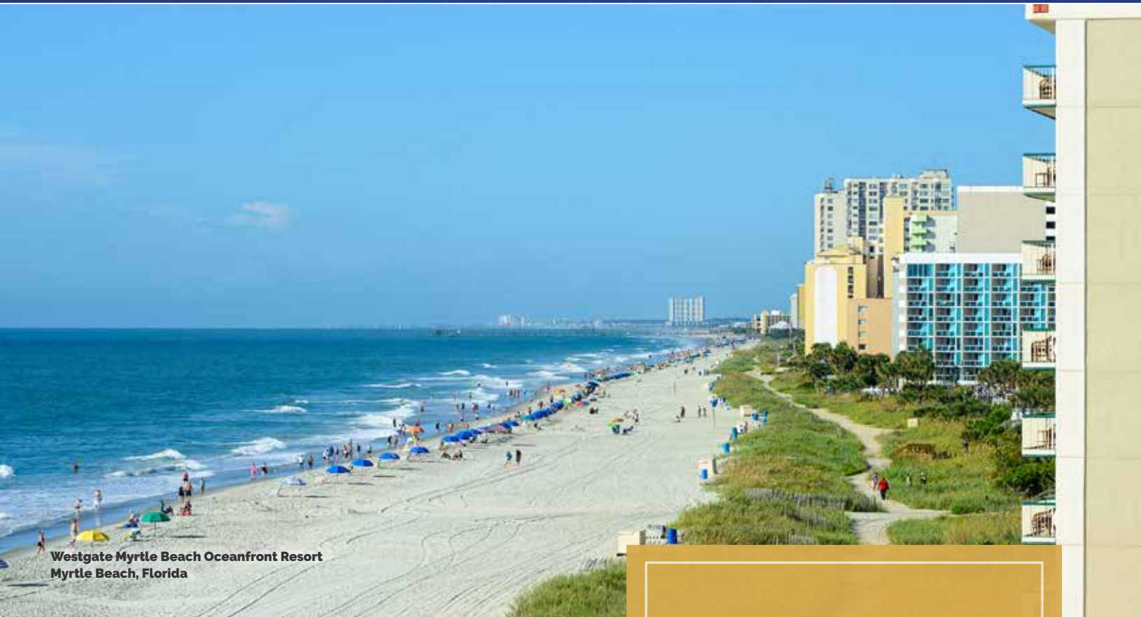
Westgate Myrtle Beach Oceanfront Resort Myrtle Beach, Florida