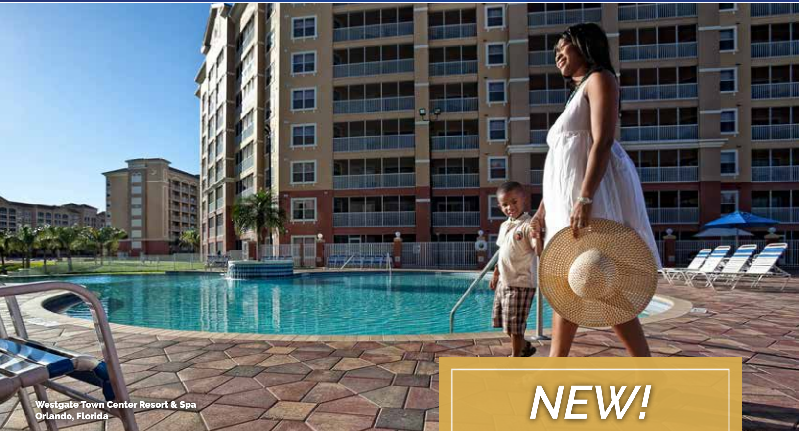
Westgate Town Center Resort & Spa Orlando, Florida