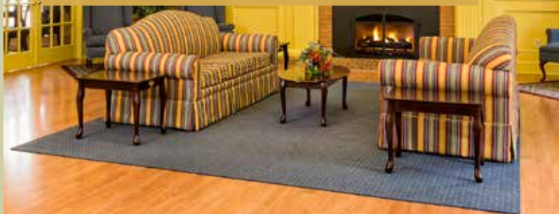
Westgate Historic Williamsburg Resort

Call Westgate Resorts to reserve, deposit, or bank your week before the end of your occupancy year.