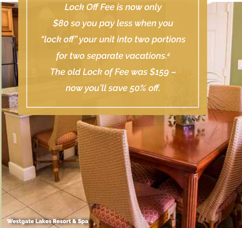
Westgate Lakes Resort & Spa

FOR EXAMPLE: If you own a two bedroom Lock Off, you may use one bedroom for one portion of your vacation and the remaining studio for another vacation at the lowered cost of $80.