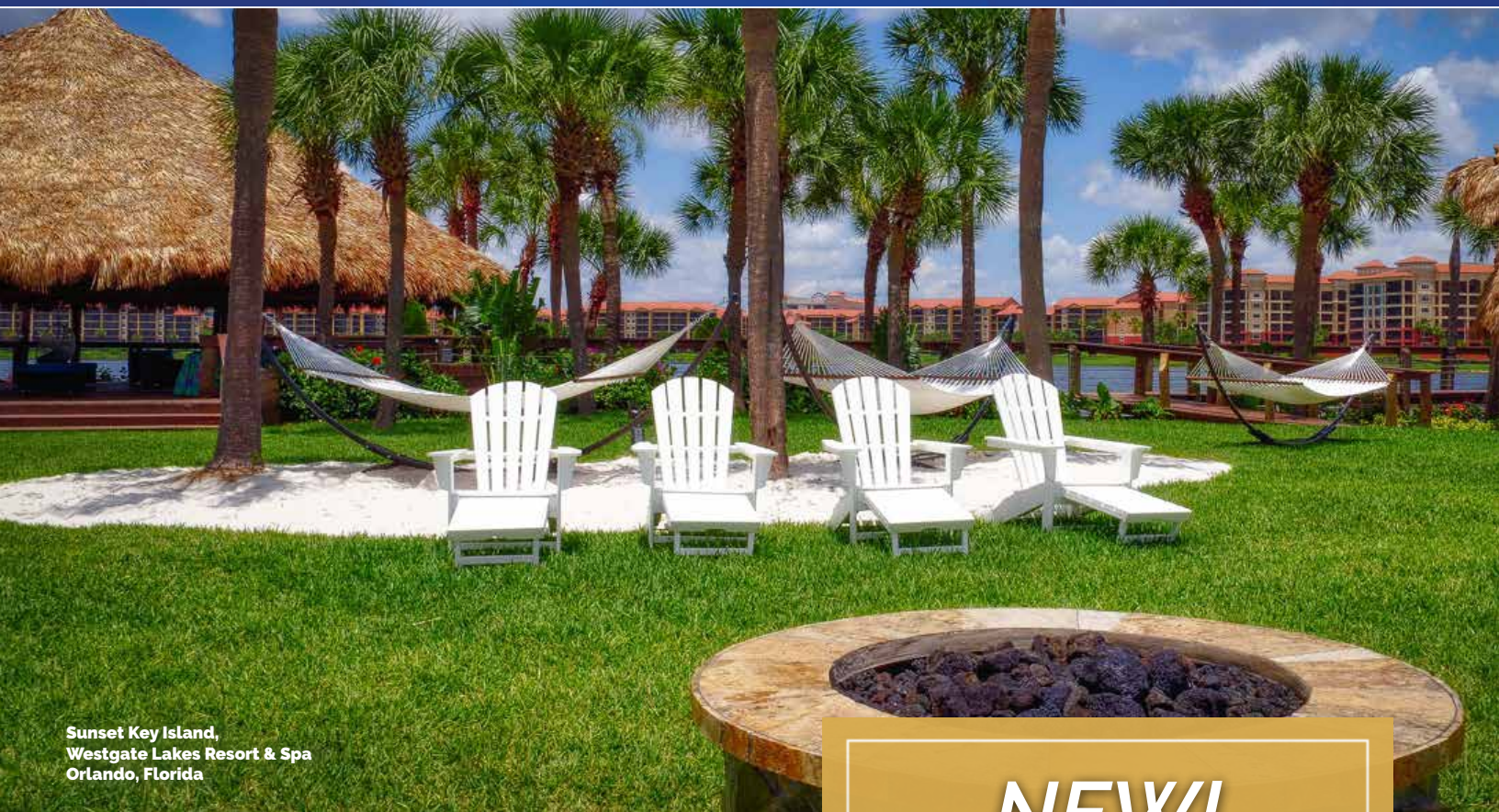
Sunset Key Island, Westgate Lakes Resort & Spa Orlando, Florida