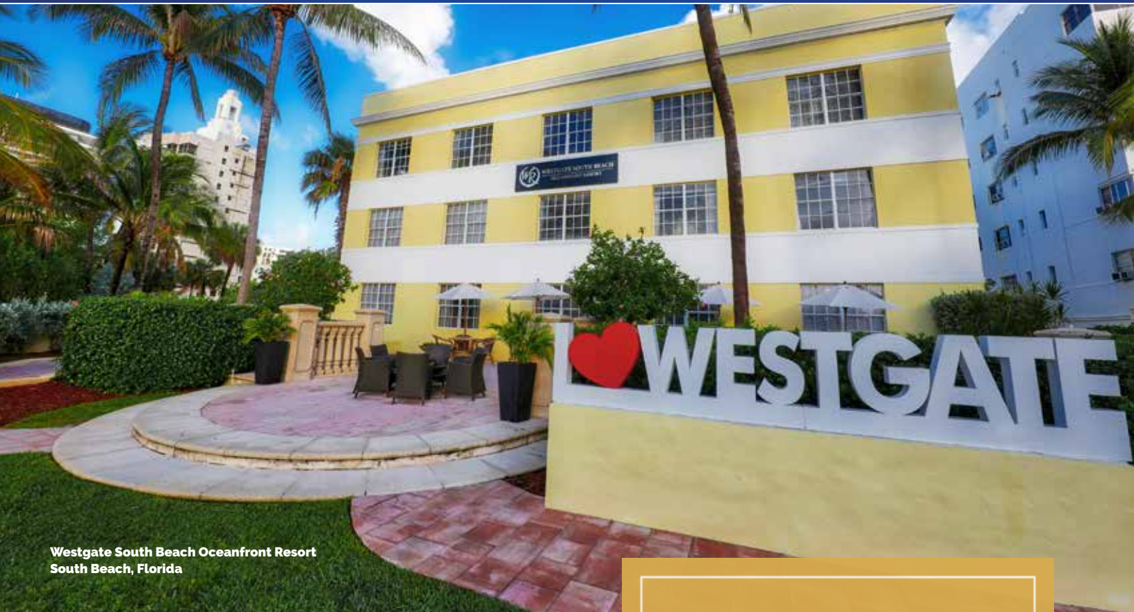
Westgate South Beach Oceanfront Resort South Beach, Florida